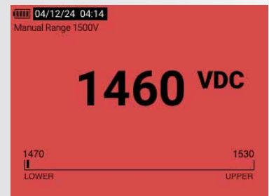
Limit gauge – outside of range