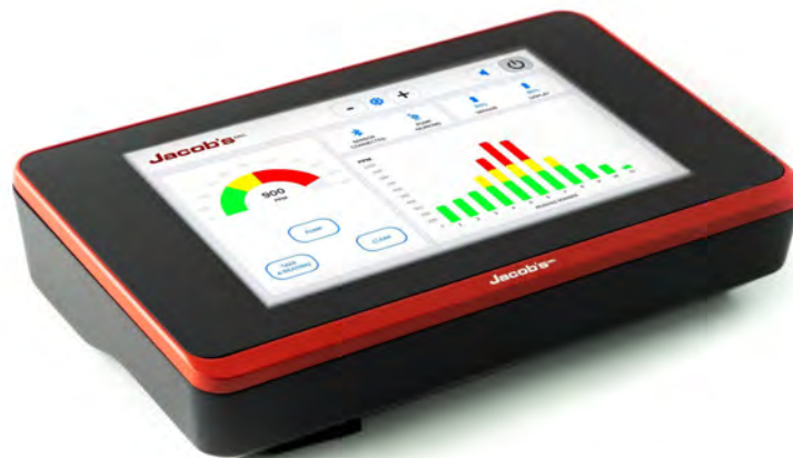
Figure 1. SNIFFER 430 Device.