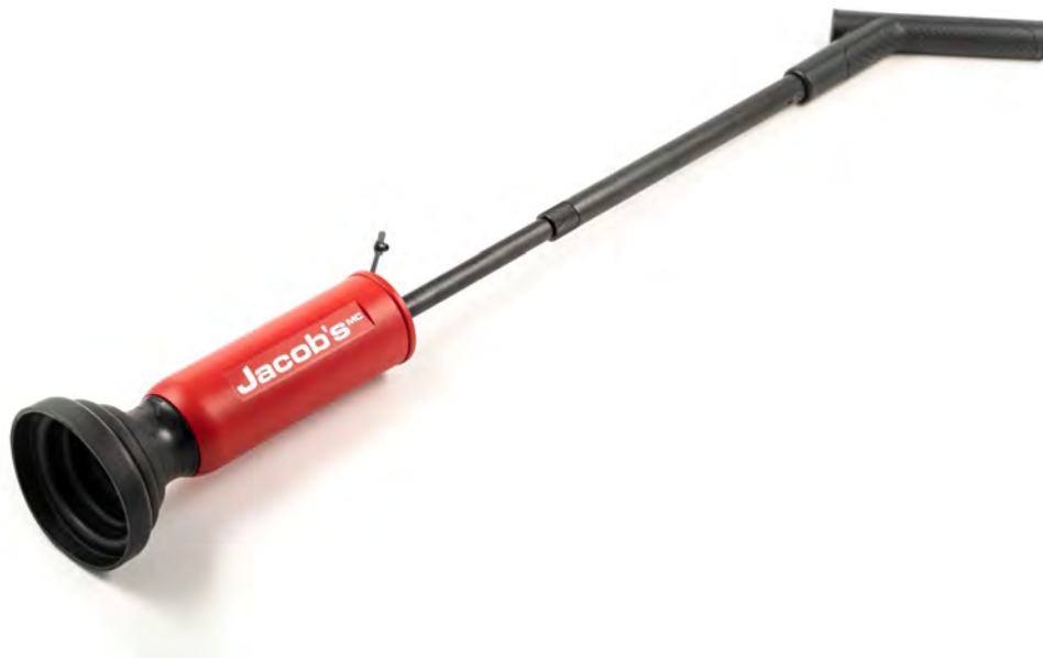
Figure 2. SNIFFER 430 H 2 Sensor.