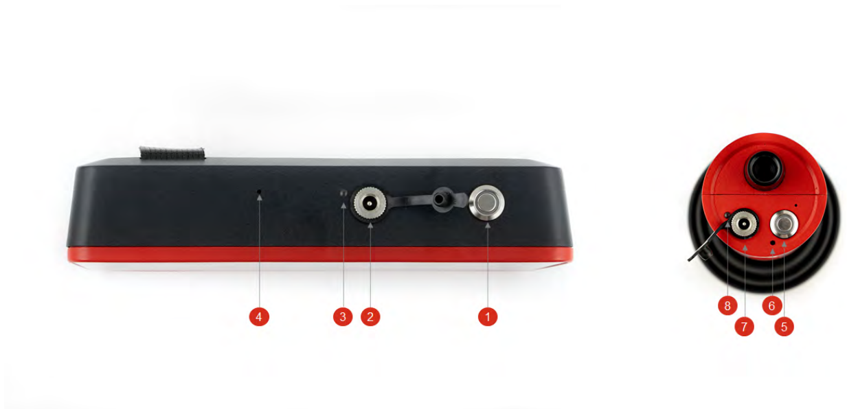
Figure 4. SNIFFER 430 Device and H2 Sensor