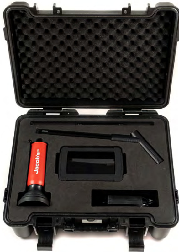
Figure 3. SNIFFER 430 System Kit.