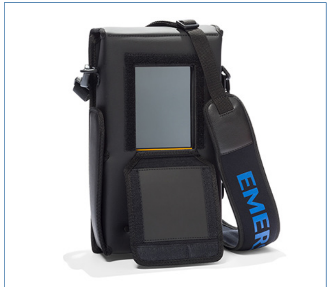
The useful carrying case protects your Trex unit in the field and provides storage options for accessory items.

Using the ValveLink Mobile app on the Trex unit, you can perform valve diagnostics in the field, including valve signature, dynamic error band, PD one button sweep, and step response, without having to pull the valve or perform invasive troubleshooting steps. ValveLink Mobile works with HART and FOUNDATION Fieldbus Fisher® FIELDVUE™ digital valve controllers and provides an intuitive user interface that is easy to understand and use. The large touchscreen on the Trex communicator makes it easier than ever to see all valve diagnostic details.