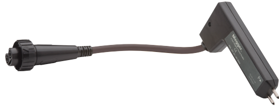
DTP1-C Duplex Twist Probe 1 - Connect Order part number: 1006-449