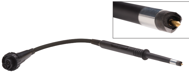
CP1-C Concentric Probe 1 - connect Order part number: 1006-448