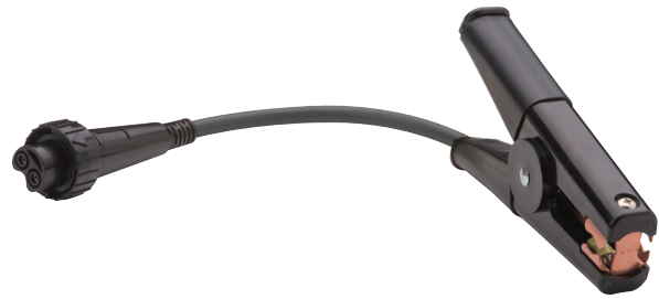
KC1-C Kelvin Clip 1 - connect Order part number: 1006-447